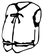
Life Preserver (Type I)