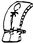
Buoyant vest (Type II)